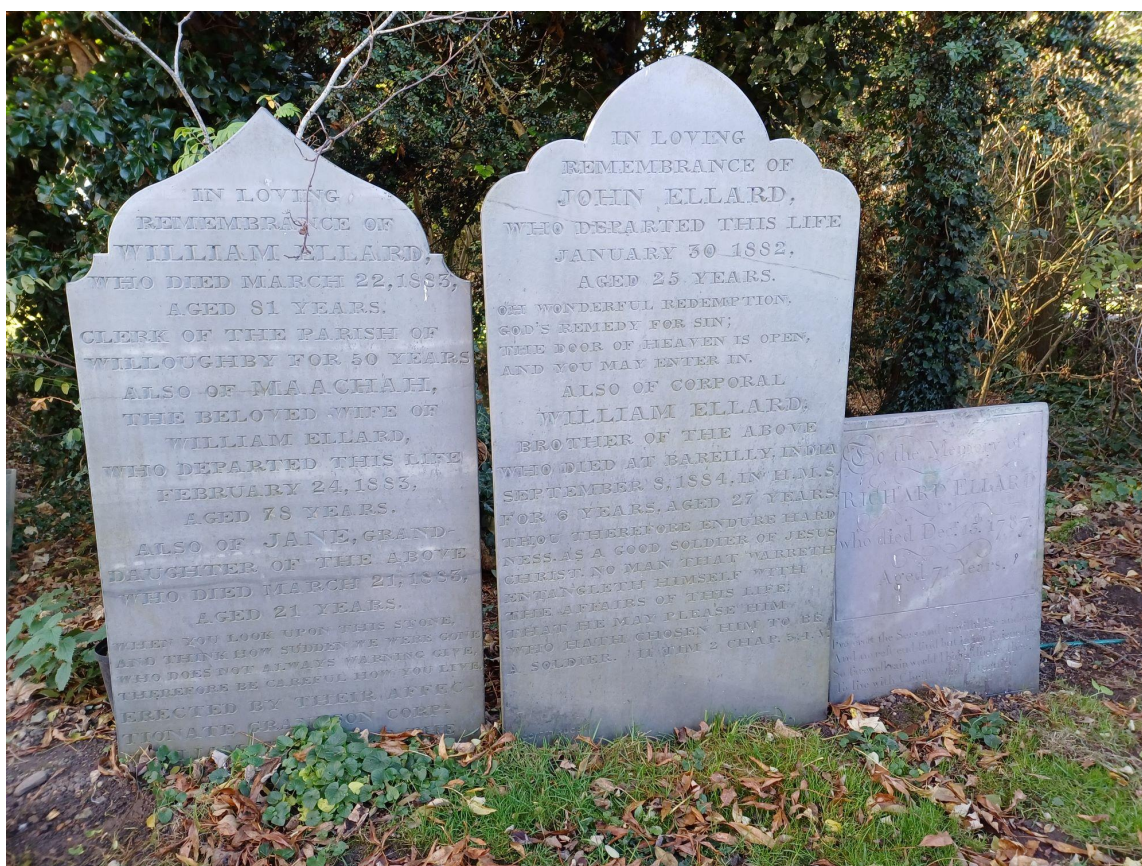
Graves 13, 14 and 15 - Ellard