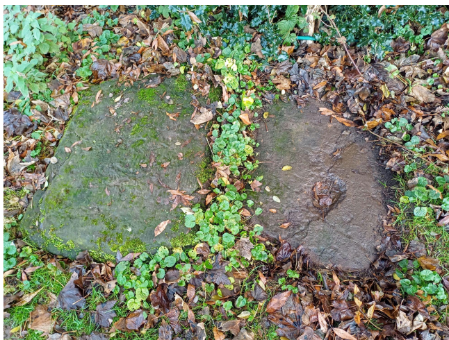
Grave 16 on the left - Grave 17 on the right